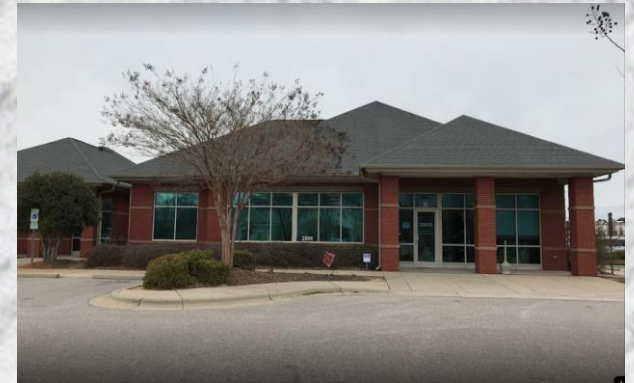
Regional Medical Oncology Center Annex Building